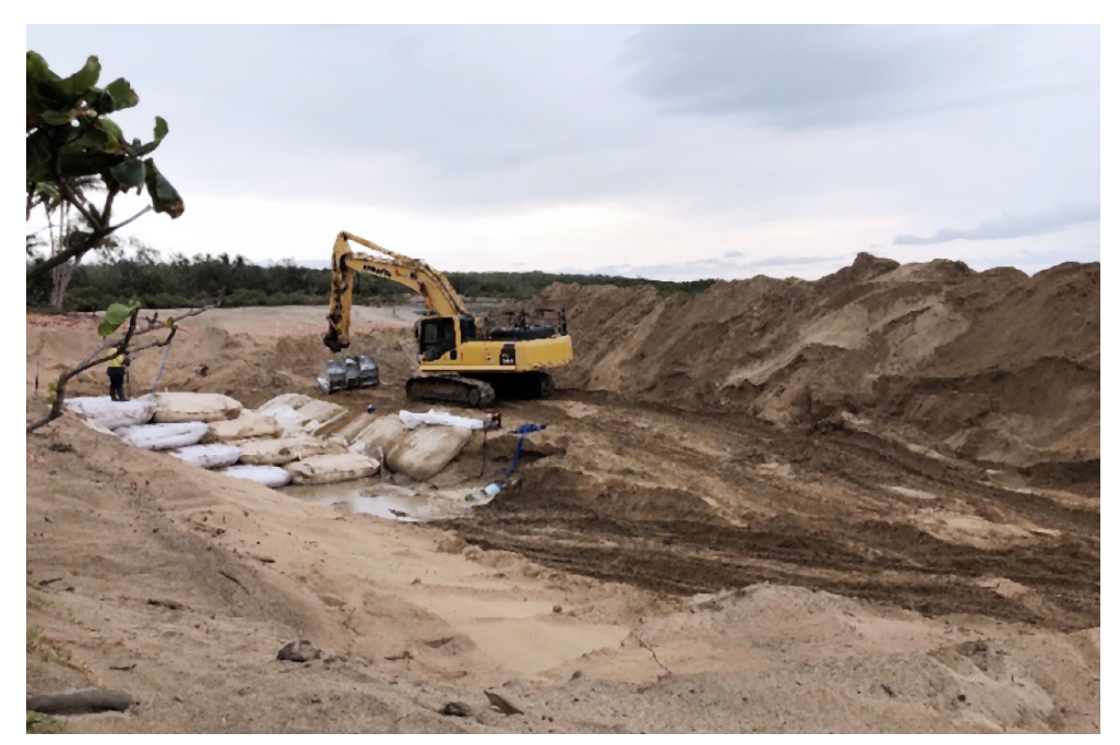
Replenishment works underway at Midge Point Beach – October 2018