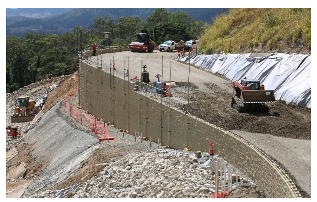
Mass block retaining wall at the main slip site on the Sarina Range along Marlborough - Sarina Road

The wall was completed in early September 2018, allowing the road to be reopened to traffic control from 8 October 2018. Restoration works remain on track to be completed by December 2018, weather permitting.