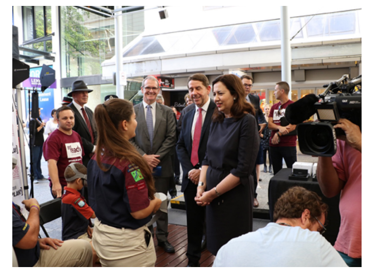
The Premier and Minister met with scouts trying out QRA's virtual reality Get Ready game