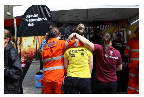
A joint effort at the Disaster Preparedness Hub at the launch of Get Ready Queensland Week

The launch was supported by Brisbane City Council and coincided with the Bureau of Meteorology's release of the Severe Weather and Tropical Cyclone Outlooks for 2018-19.