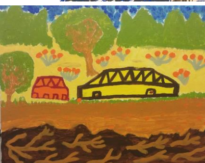
Jalunkarr kadan burayngjiku bayan bubu buyundanman. When the flood came it damaged homes and land.