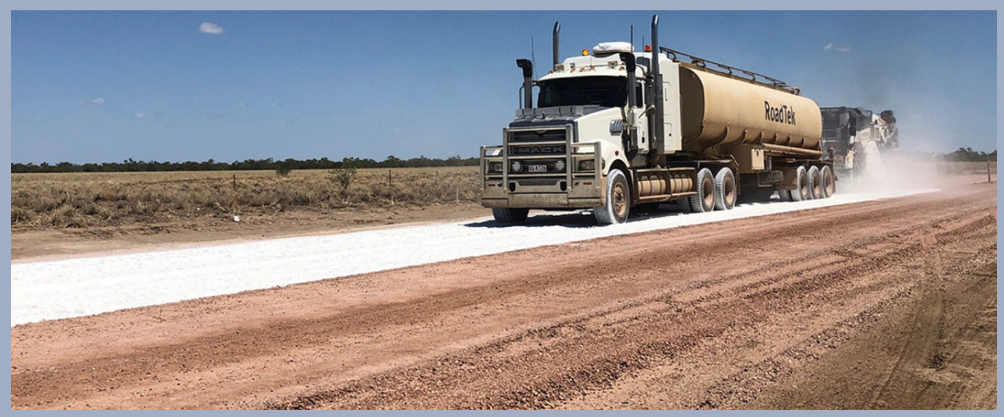
Image: Landsborough Highway (Winton–Kynuna) – betterment works in progress.

Eligible reconstruction works are jointly funded by the Commonwealth and Queensland Governments through the Disaster Recovery Funding Arrangements (DRFA).