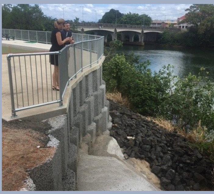
Images (left): New bowling green. (Top right): a flooded Innisfail Bowls Club – February 2019 (right bottom) new retaining wall.