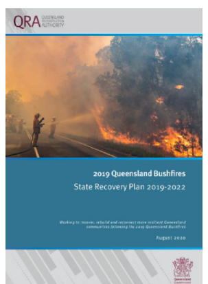
Local Recovery Plans

Currently, the Queensland Bushfires (2019) recovery plan is being implemented. QRA is monitoring the progress of recovery activities, with functional recovery groups reporting that the recovery objectives are either complete or in progress/on track.