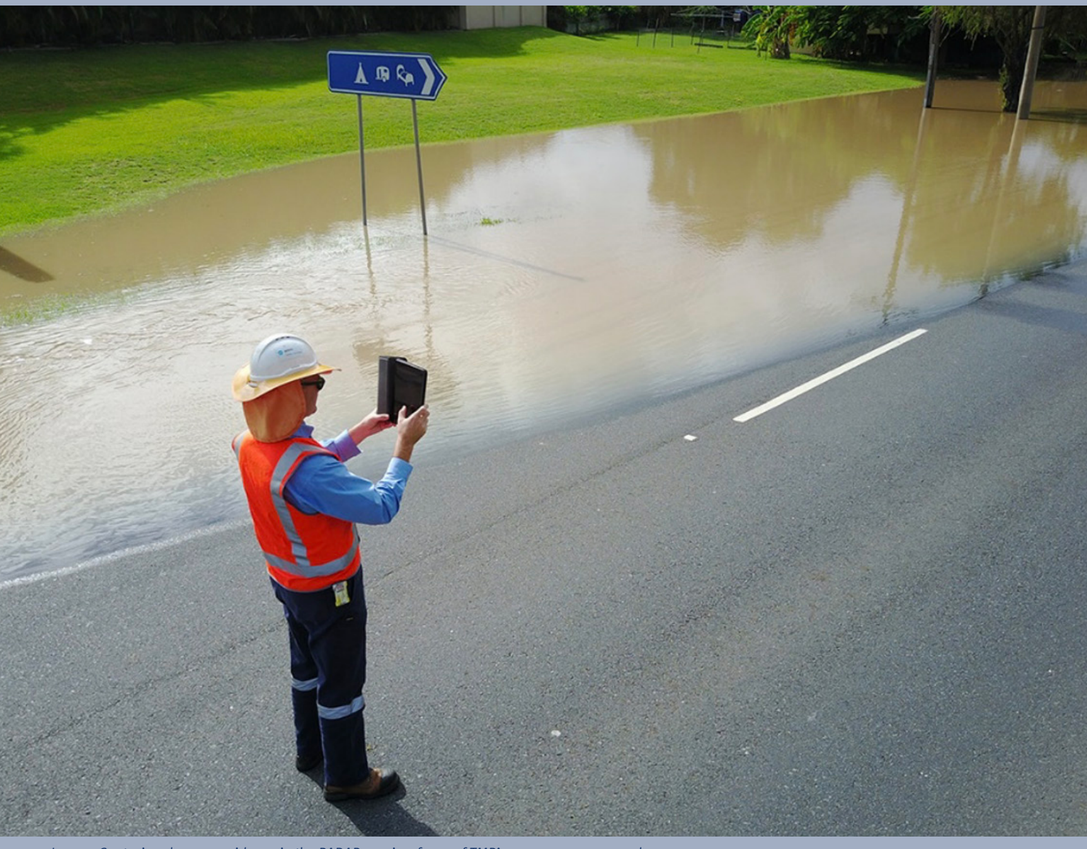
Image: Capturing damage evidence in the RADAR app is a focus of TMR's pre-season preparedness program.

In addition to advice on taking photos, this year's program covers emergency works scope and documentation, engaging appropriate resources promptly to expedite damage assessment and scoping of reconstruction works, and managing reconstruction scope changes where required. Follow-up training and assistance in using TMR's RADAR app will continue throughout the summer.