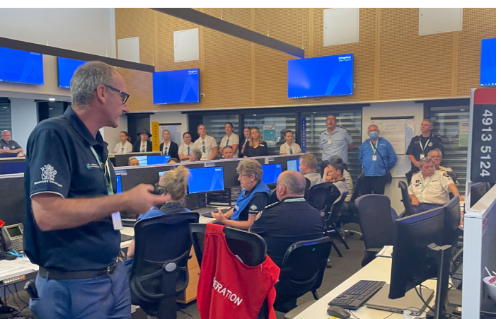
Livingstone's Response and Recovery exercise.