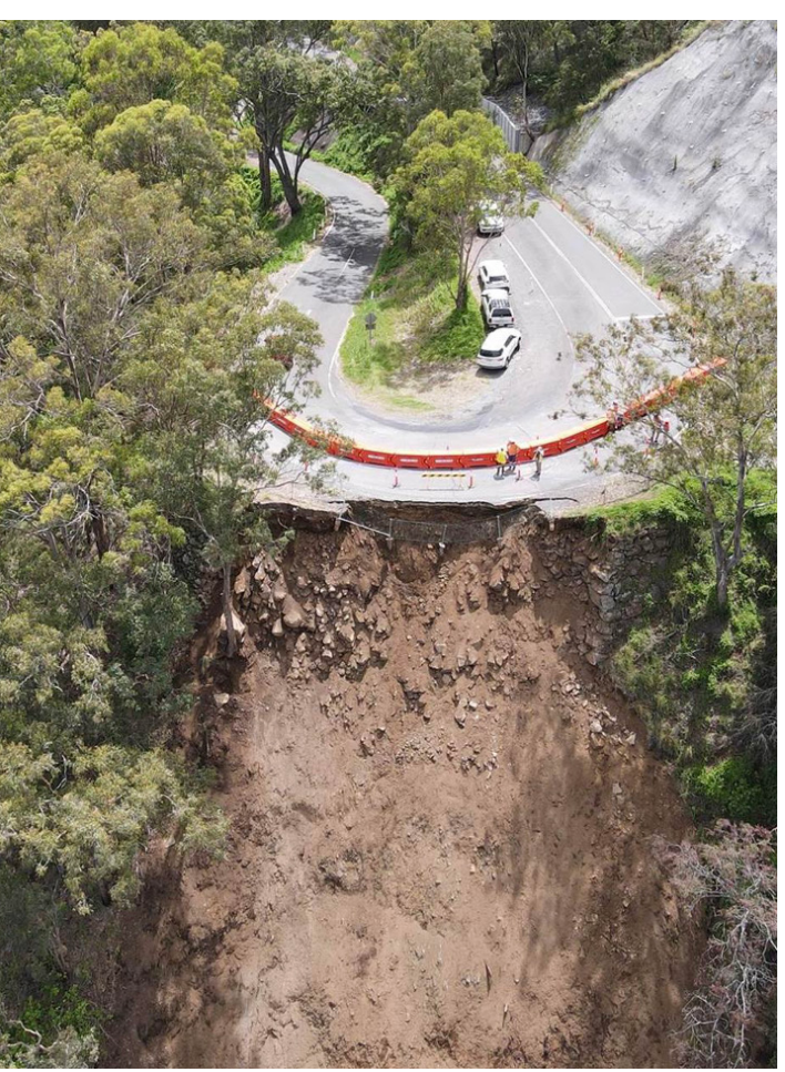
Lamington National Park Road.