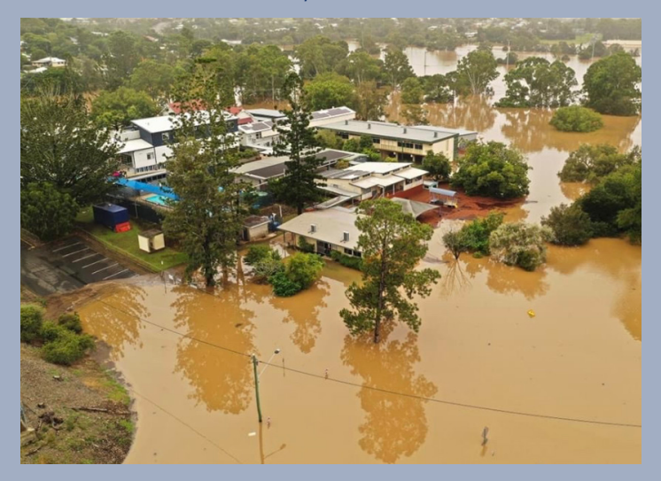
Images (from above clockwise): Flooded homes in Gympie, Marborough and Ipswich may be eligible for the $741 m Resilient Residential Recovery Program.