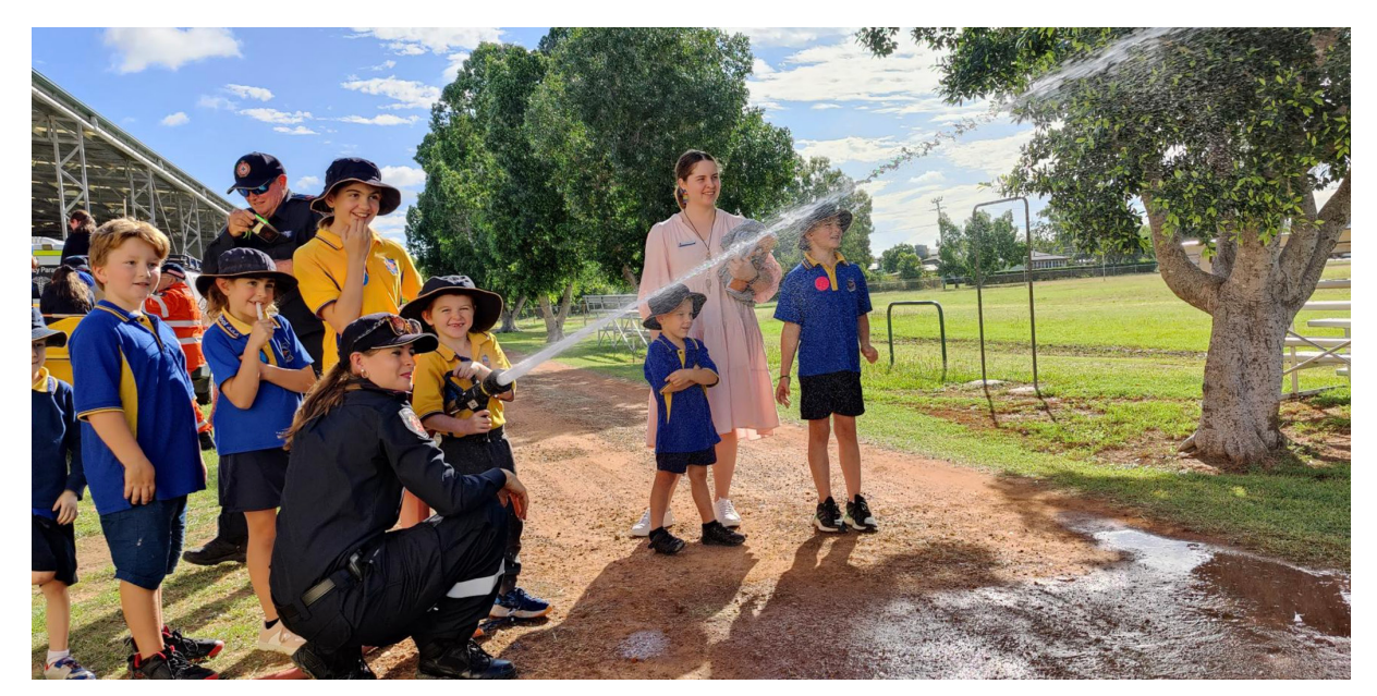
Image: Caption: Students at Blackall State School enjoy the Get Ready Queensland school visit.

Six schools enjoyed Get Ready Queensland games and presentations, as well as displays from local SES, police, ambulance and fire services. Children got to share their own stories of disaster resilience and be inspired for careers in emergency services. Get Ready Queensland have been invited to make it an annual event.