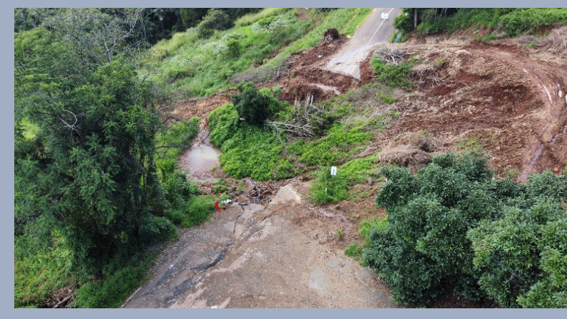
Image: Black Mountain Road damage following February rain and flooding event in 2022.

The original road section included a concrete causeway which would regularly overtop with 20 millimetres of rain in the catchment.