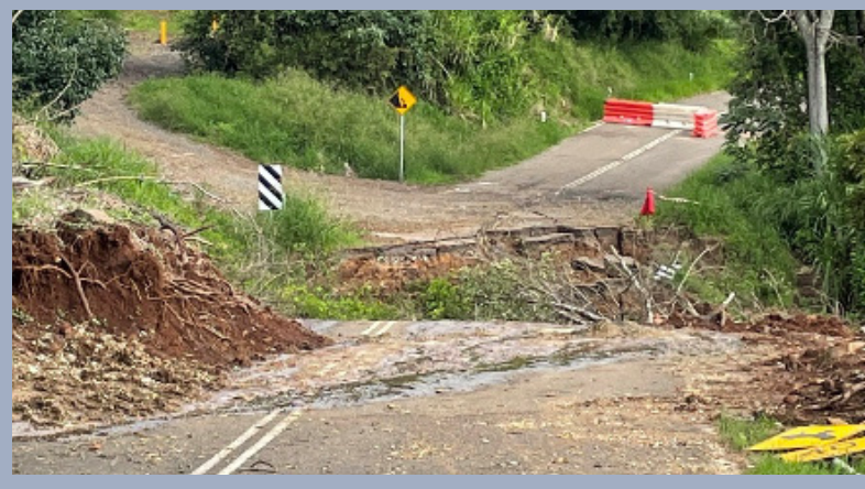
Image: Black Mountain Rd in disarray following February rain and flooding event in 2022.