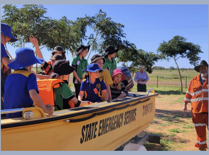
Jundah State School.

We can never stop natural disasters from occurring, but with the right investments made and support provided we can reduce disaster impacts, for the benefit of every Queenslander.