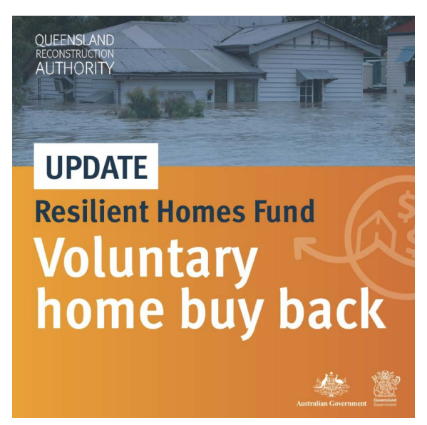
Further details: <u>Resilient Homes Fund Eligibility and funding</u> <u>factsheet</u>.

Brisbane City Council (BCC) has agreed to administer the voluntary home buy back for those eligible properties in the Brisbane local government area. Workshops occurred mid-July which identified initial tranche of priority properties, with independent valuations and negotiations to commence shortly. BCC will continue consultation with people who have registered interest for voluntary buy-back over the coming months.