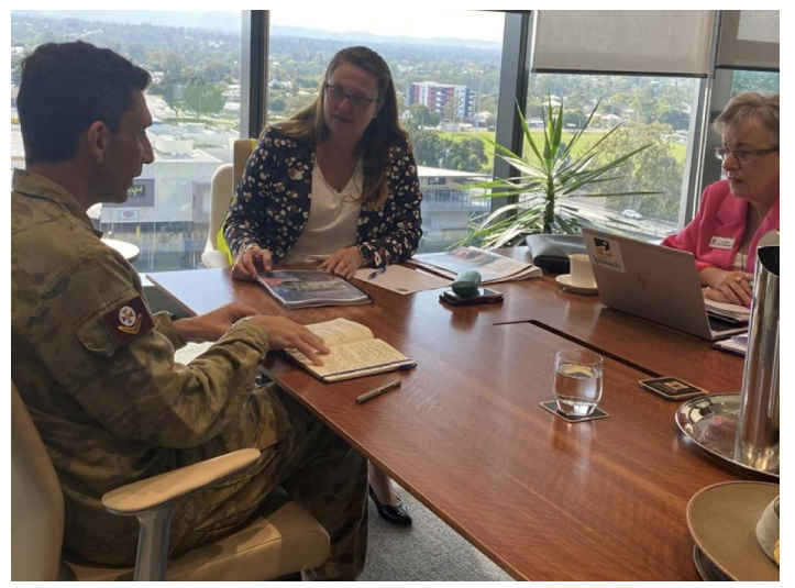
Images above and clockwise: Major General Jake Ellwood continued to meet with representatives from local government areas affected by the Southern Queensland Flooding.