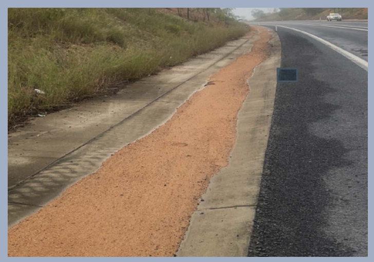
Image: Bruce Highway (Gin Gin–Benaraby). Silt build-up on road shoulder at Cabbage Tree Creek.