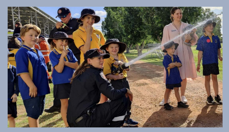
Blackall State School.

Like all successful disaster response and recovery efforts, delivery hinges on many agencies working cohesively, so it's only suitable the Get Ready Queensland school visits bring together various local emergency services members to stand up on a different kind of frontline.