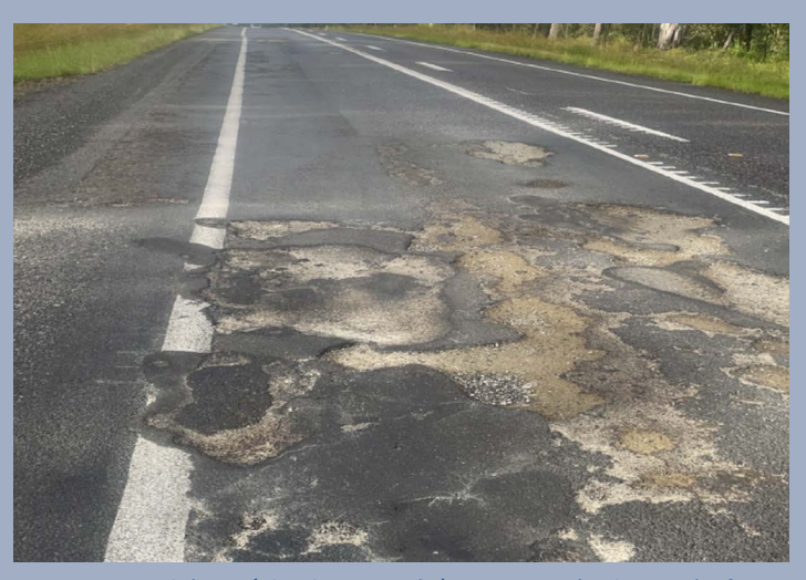
Image: Bruce Highway (Gin Gin–Benaraby). Pavement shoving north of Takilberan.