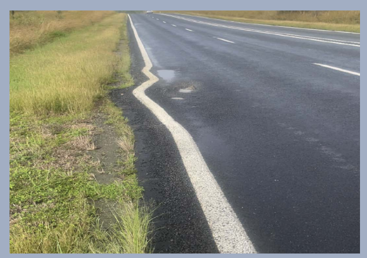
Image: Bruce Highway (Gin Gin–Benaraby). Pavement rutting south of Rosehill Road.