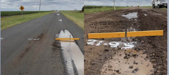
Images above: Bowenville–Norwin Road. Further damage after rain in late January 2022