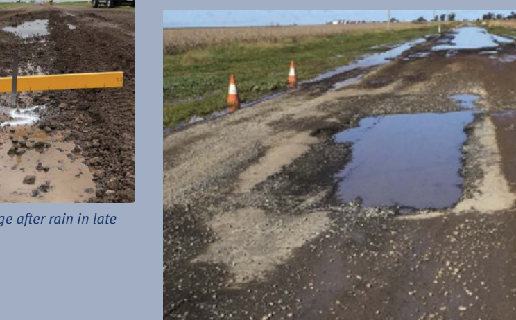
Image: Bowenville-Norwin Road. Significant damage to the road surface after combined weather events (May 2022).