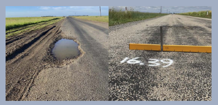
Images above: Bowenville–Norwin Road. Pothole after rain in December 2021 and subsequent repairs in January 2022.

Transport and Main Roads (TMR) closed the road to all traffic in some locations as it was presenting considerable safety hazards. TMR contractors were attending to potholes and carrying out repairs as resources allowed, however the continued rain restricted the effectiveness of the repairs.