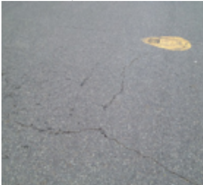
Location, nature and extent of damage to an eligible asset is not evidenced. No asset visible, no significant damage directly related to an event, no perspective of the scale of defects or location.