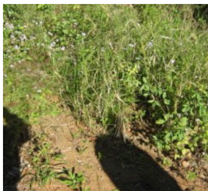
No asset and no damage apparent