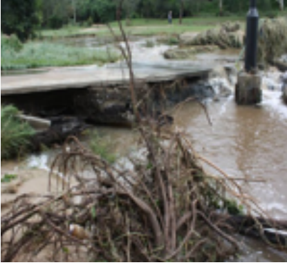
Provide a visual perspective of the nature and extent of damage to the asset and damaged components