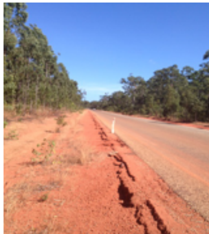
Photo demonstrates location nature and extent of event damage to the asset