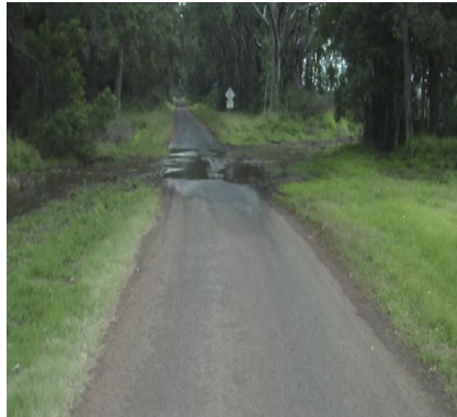
No event damage visible