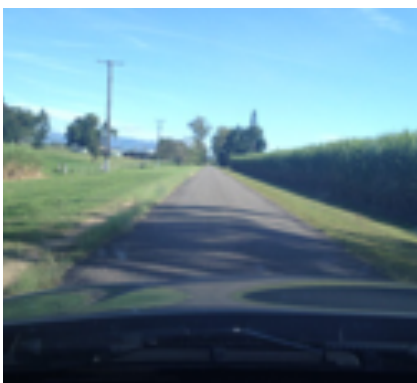
Photos taken through windscreens do not demonstrate clear damage or scale of damage