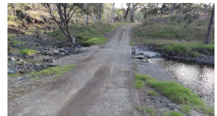
Photo demonstrates overview and asset scouring