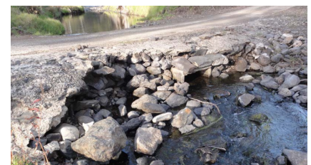
Provide close up photos supporting damage to all damaged asset components – eg upstream, downstream and approaches