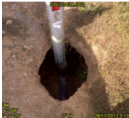
Use of post or measure to demonstrate depth of subsidence