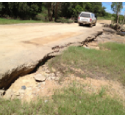
Nature and extent of event damage supporting the claimed scope