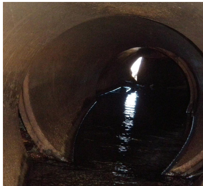
Demonstrate the nature and full extent of event damage to asset components. E.g. inside damaged pipe showing damage