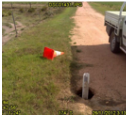
Use a measure, ruler or other available prop to demonstrate extent and nature of damage and support proposed scope of works – e.g. sinkholes/blowholes