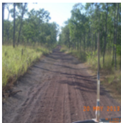
Evidence supporting nature and extent of asset damage is consistent along the distance