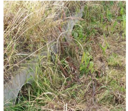
No damage and no asset visible to assess