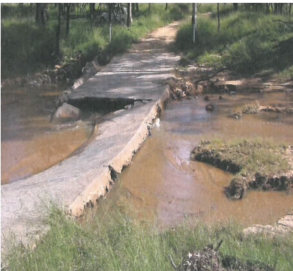
Show surface and structural damage to asset and approaches