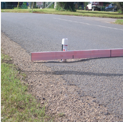
Use of straight edge, taken close up and angled level with the damage