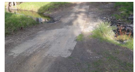
Overview of the asset, asset approaches and crossing location