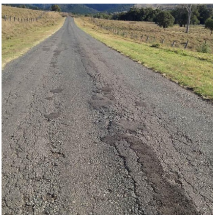
Photo demonstrates post event damage extending into distance