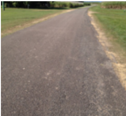
No event damage evident