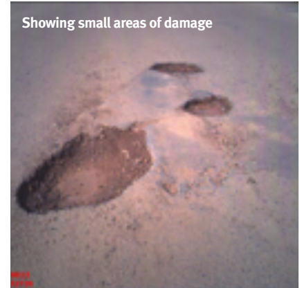
Showing small areas of damage