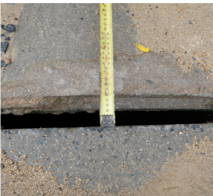
Use a tape to demonstrate the extent of damage to pipe