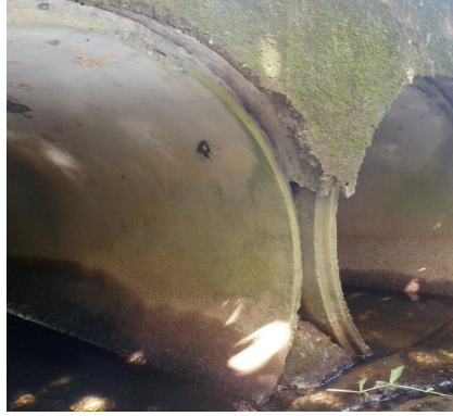
Demonstrate event damage to claimed asset components