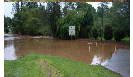
Provides event impact on the asset – full nature and extent of damage to the asset not yet assessed