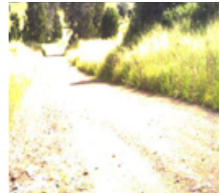
Unable to see damage