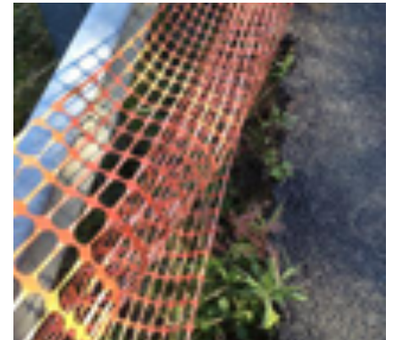
Landslips – show the context of slip and the nature and extent of its impact on the eligible asset