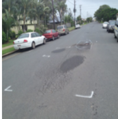
Use spray mark ups to show event damage and proposed scope of works