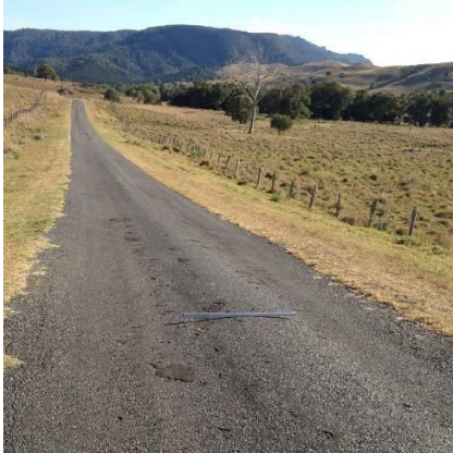
Use a straight edge to demonstrate the nature and extent of damage to the asset