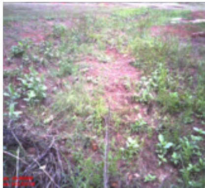
Asset not apparent, Damage not apparent