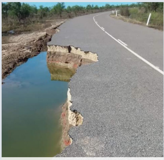
Wills Developmental Road (Julia Creek–Burketown) – damage from Northern and Central Queensland Monsoon and Flooding (March 2023)

Assistance will be provided through the jointly funded Commonwealth-State DRFA.