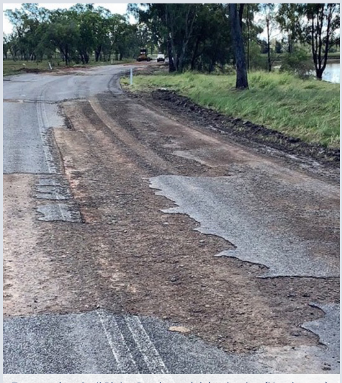
Toowoomba-Cecil Plains Road – seal delamination (March 2022)

Assistance will be provided through the jointly funded Commonwealth-State Disaster Recovery Funding Arrangements (DRFA).