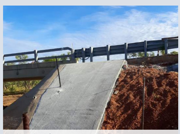
Barkly Highway (Mount Isa–Camooweal) at Inca Creek – emergency works (March 2023)