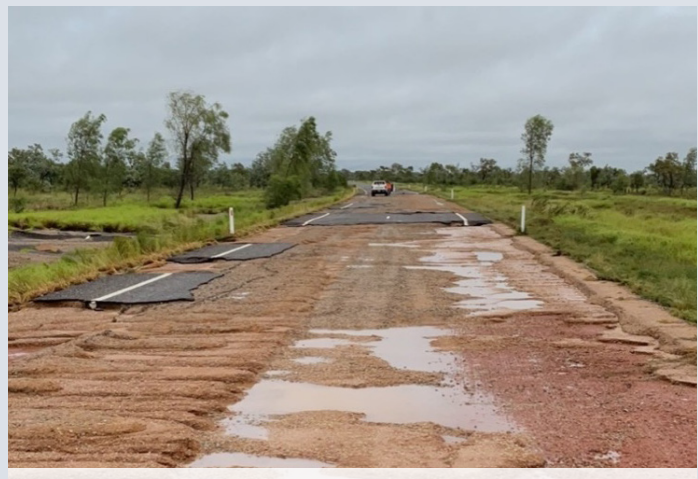
Barkly Highway (Mount Isa-Camooweal) at Nowraine Creek – damage from Northern and Central Queensland Monsoon and Flooding (March 2023)