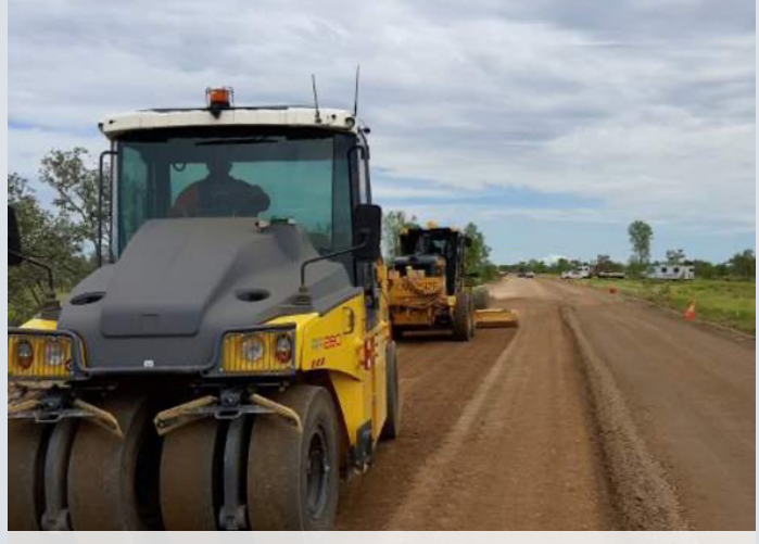
Barkly Highway (Mount Isa–Camooweal) at Nowraine Creek – emergency works (March 2023)

Transport and Main Roads (TMR) prioritised emergency works, with a RoadTek concrete crew deployed as soon as floodwaters receded to begin abutment repairs at Inca Creek bridge on 13 March 2023. A pavement repair crew began works at Nowraine Creek the following day. This enabled the Barkly Highway (Mount Isa–Camooweal) to reopen via single lane under traffic control on 16 March 2023.