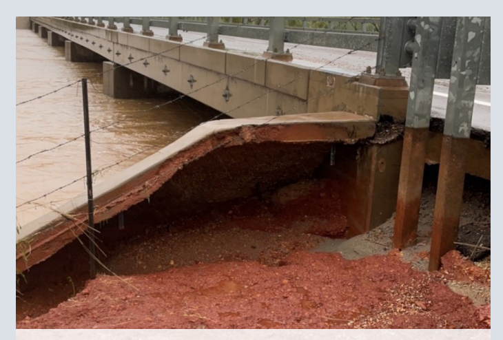
Barkly Highway (Mount Isa-Camooweal) at Inca Creek – damage from Northern and Central Queensland Monsoon and Flooding (March 2023)