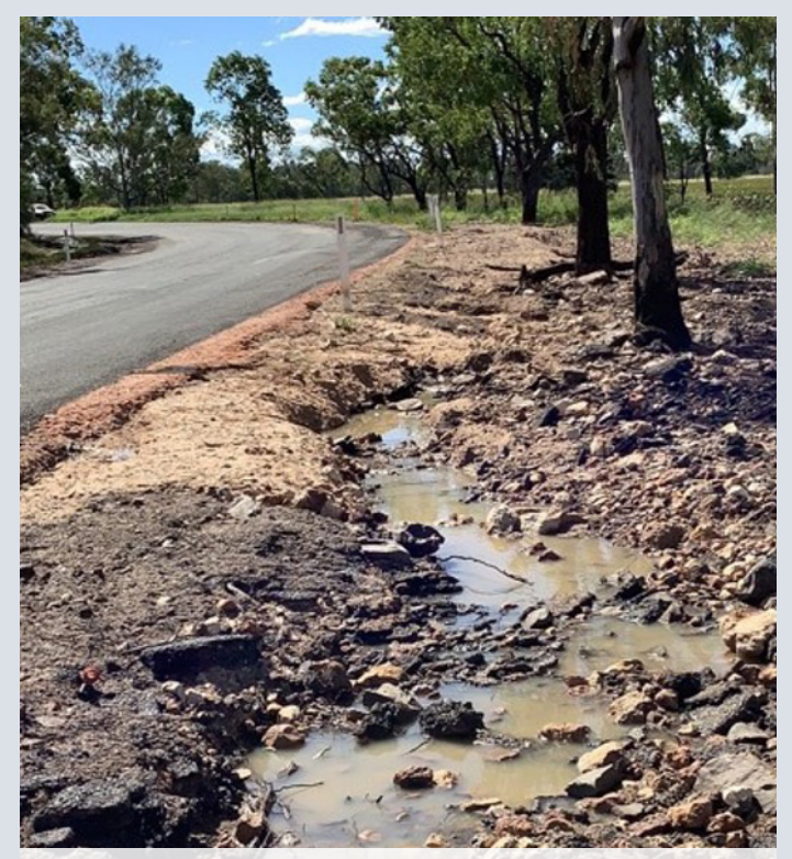
Toowoomba–Cecil Plains Road – shoulder scouring (March 2022)