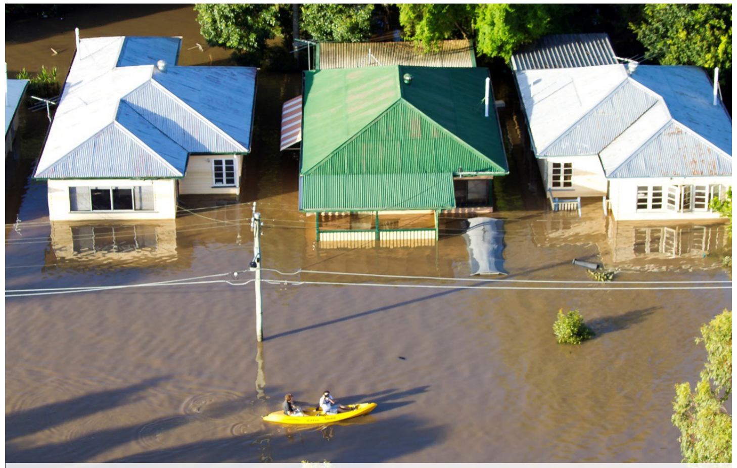
South East Queensland community experiencing major flood levels

The results of the research will shape future campaigns and the design of important tools that will guide Queenslanders through their personalised preparations.