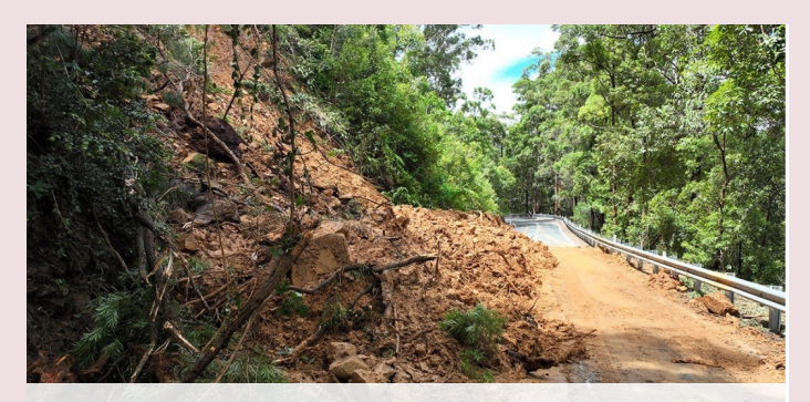
Gold Coast–Springbrook Road – Site 8 landslip following SEQ Rainfall and Flooding event (February 2022)

Assistance will be provided through the jointly funded Commonwealth-State Disaster Recovery Funding Arrangements (DRFA).