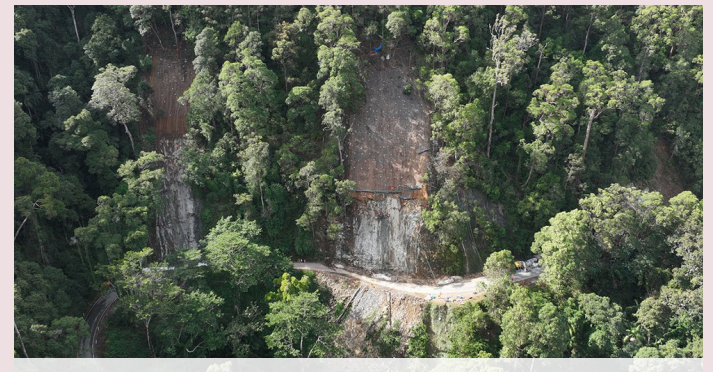
Gold Coast-Springbrook Road – slope stabilisation works in progress at Site 1 (May 2023)