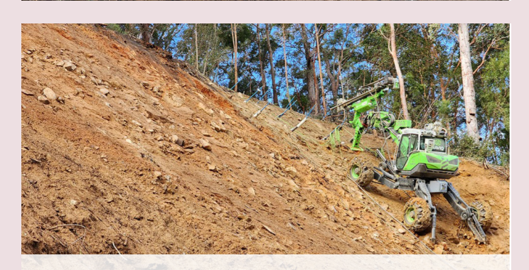
Gold Coast–Springbrook Road – spider rig undertaking soil nailing on Site 8 (April 2023)