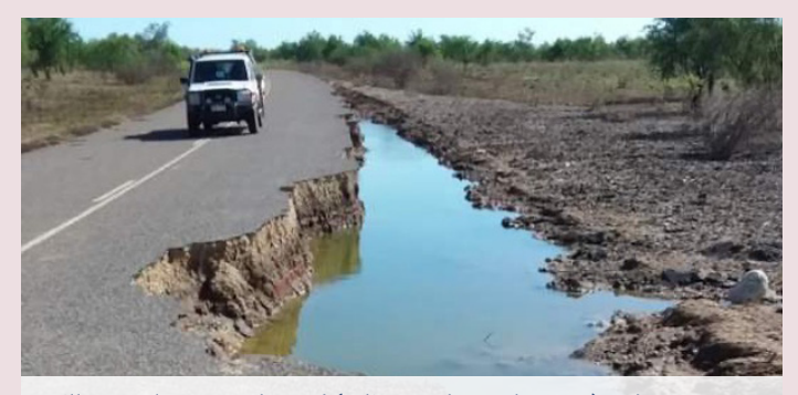
Wills Developmental Road (Julia Creek–Burketown) – damage from Northern and Central Queensland Monsoon and Flooding (March 2023)