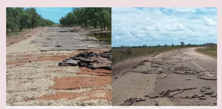
Wills Developmental Road (Julia Creek–Burketown) – pavement delamination and scouring as a result of Northern and Central Queensland Monsoon and Flooding (March 2023)