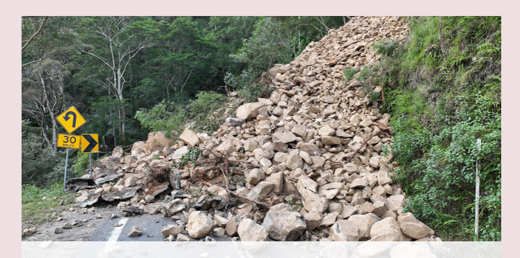
Gold Coast–Springbrook Road – Site 1 landslip following heavy rainfall in late March 2022