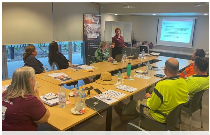
QRA Recovery staff presenting Disaster Funding Arrangements (DFA) training at Douglas Shire Council

The resilience and recovery team has recently delivered Disaster Funding Arrangements training to a number of councils including Western Downs Regional Council, Southern Downs Regional Council, Lockyer Valley Regional Council, Longreach Regional Council, Bundaberg Regional Council, Fraser Coast Regional Council and North Burnett Regional Council. This training helps build capacity within councils to develop further knowledge and understanding of the Disaster Recovery Funding Arrangements and the State Disaster Relief Arrangements.