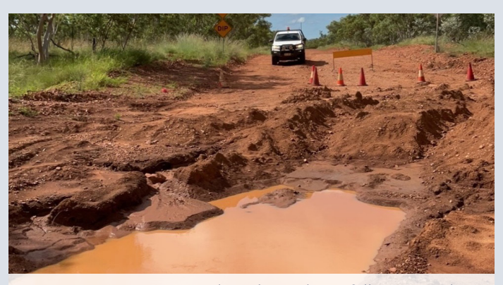
Gregory Downs–Camooweal Road – washouts following Northern and Central Queensland Monsoon and Flooding (February 2023)