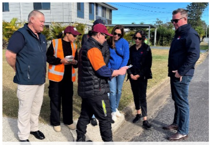
QRA and NSW Reconstruction Authority staff during 15 month post – SE QLD Floods DARM