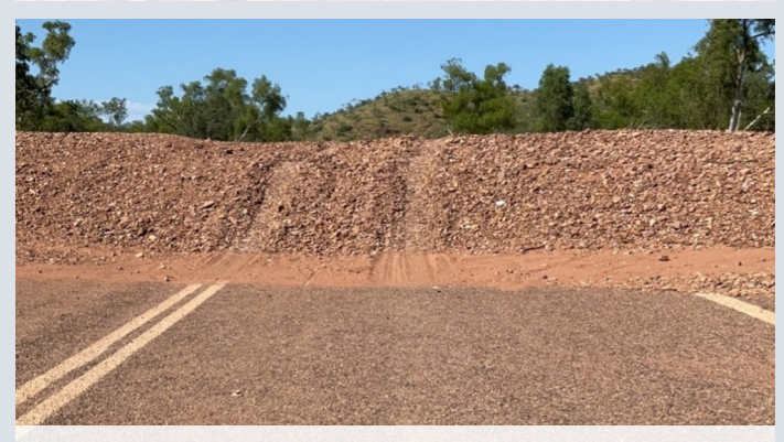
Gregory Downs–Camooweal Road – river gravel over road at Police Creek (March 2023)