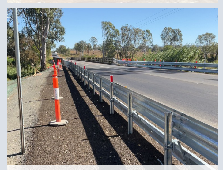
Lockyer Creek Bridge – restored guardrail prior to final line-marking (March 2023)