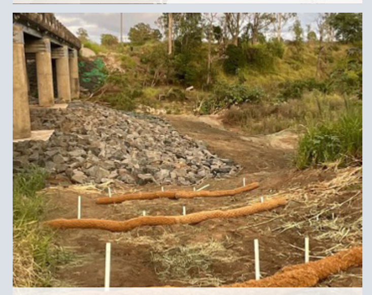
Lockyer Creek Bridge – restored rock protection (January 2023)