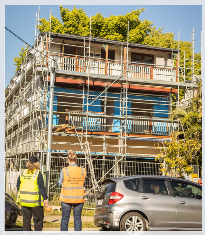
DARM assessments in action – July 2023