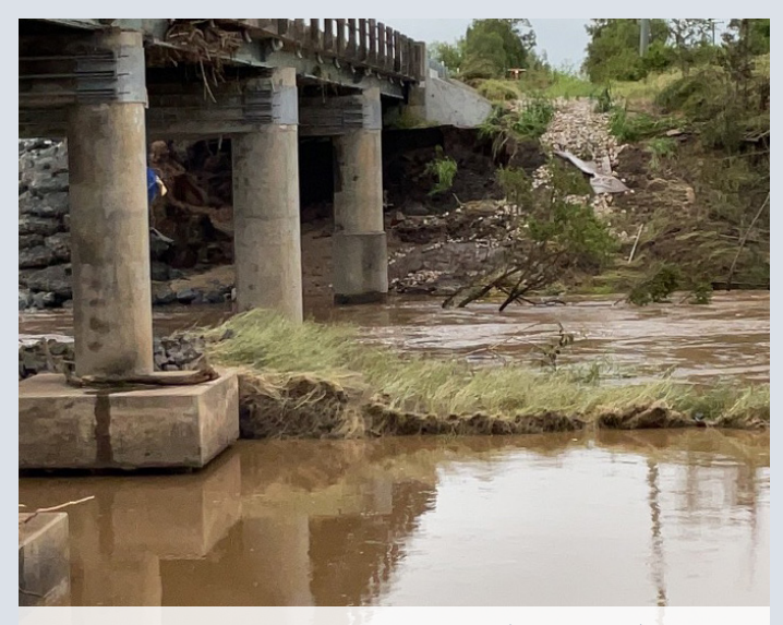
Lockyer Creek Bridge – abutment scouring (March 2022)