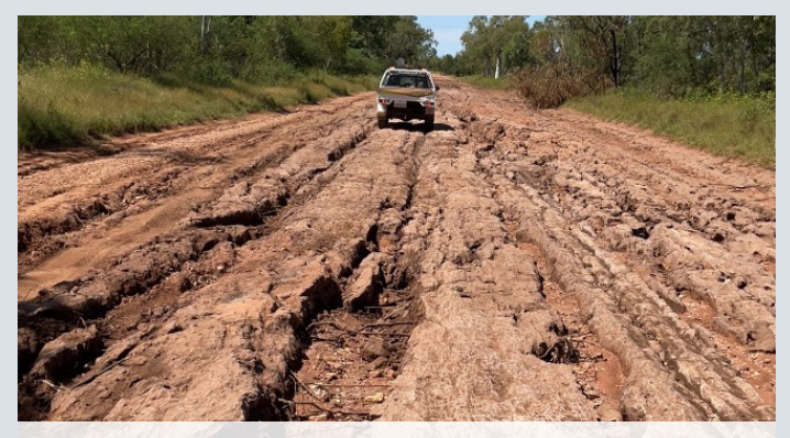
Gregory Downs–Camooweal Road – damage from Northern and Central Queensland Monsoon and Flooding (April 2023)