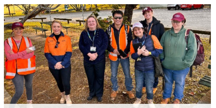
QRA Officers during recent 15 Month post – SE QLD Floods DARM

DARM results found that of the homes and businesses impacted by the severe flooding in early 2022, almost 90% of homes impacted are no longer showing signs of damage. Of the 1960 properties assessed by the teams from 10-14 July 2023, 1025 were identified as no longer damaged. 935 properties remain damaged with 403 still deemed uninhabitable. This is the final post-disaster damage assessment operation for the 2021-22 Southern Queensland Flooding events. Data collected during the operation will be disseminated to relevant Councils and State Agencies to assist in the recovery of impacted communities.