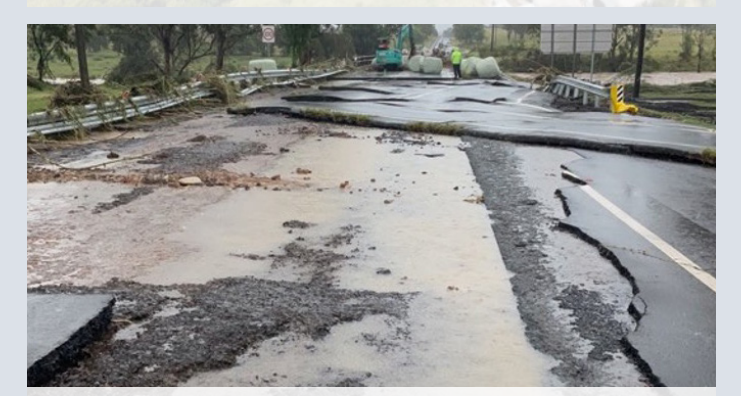
Gatton-Helidon Road – pavement damage (March 2022)