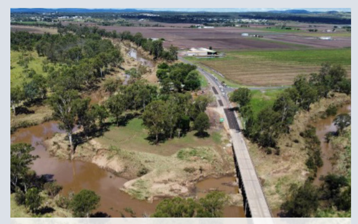
Gatton-Helidon Road – emergency works in progress at Lockyer Creek Bridge (March 2022)

Assistance will be provided through the jointly funded Commonwealth-State Disaster Recovery Funding Arrangements (DRFA).