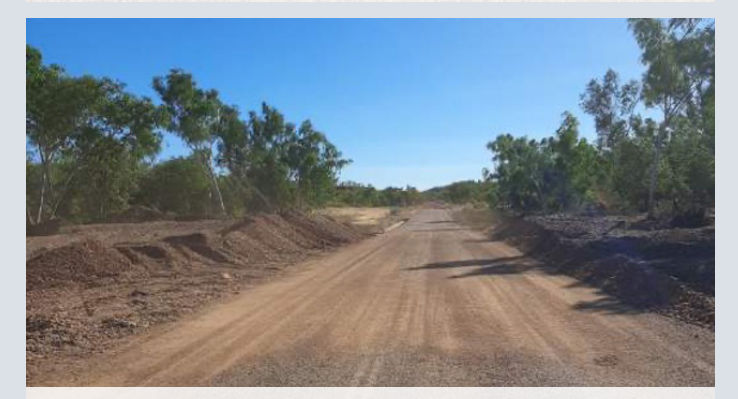
Gregory Downs–Camooweal Road – emergency works to remove gravel from road (June 2023)