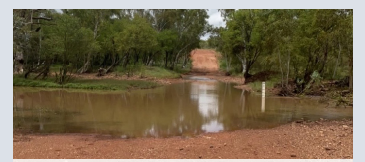
Gregory Downs–Camooweal Road – water over road at Seymour River (February 2023)

Assistance will be provided through the jointly funded Commonwealth-State Disaster Recovery Funding Arrangements (DRFA).