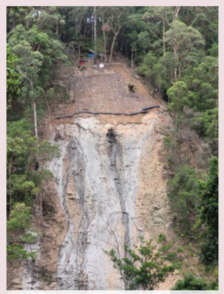
Gold Coast–Springbrook Road – works in progress at main slip site (December 2022)