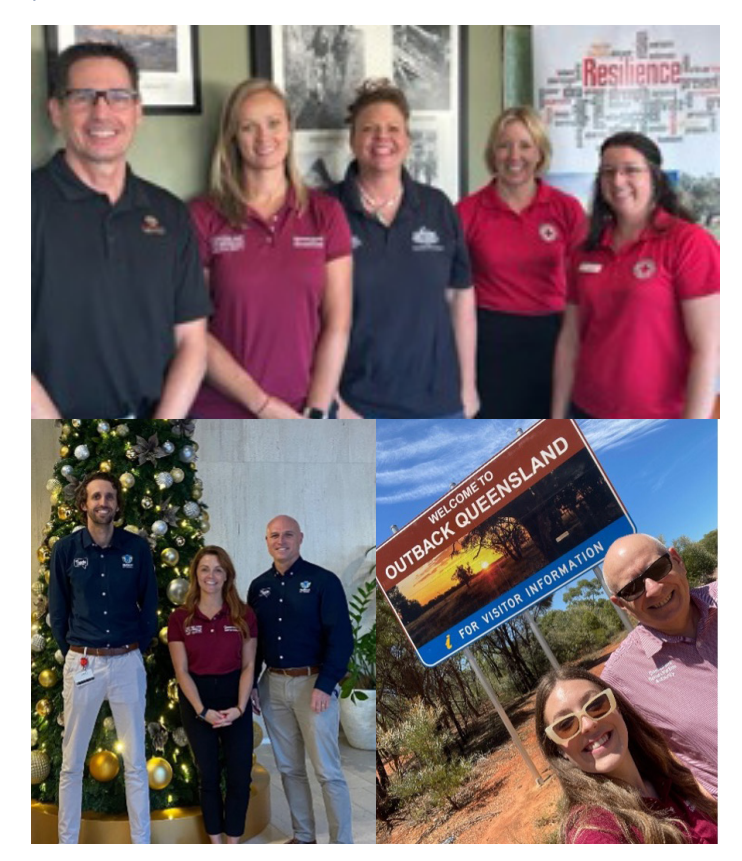
QRA Recovery staff attending a workshop session with South Burnett Regional Council, meeting with stakeholders from Redlands City Council, and travelling to meet with councils across north-west Queensland in January

Redlands City Council staff recently visited the QRA offices in Brisbane to discuss their local government recovery planning and resilience activities.