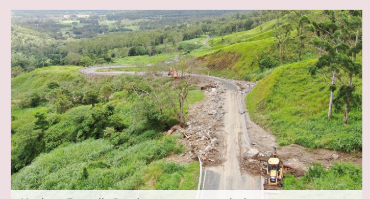
Mackay–Eungella Road – emergency works in progress (January 2023)