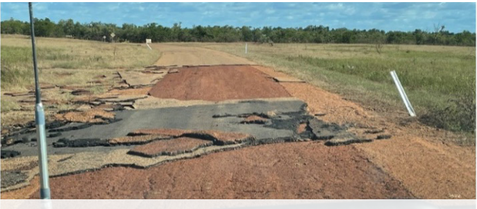
QRA staff inspecting road damage in Burke Shire Council

Additional DRFA Category C & D packages are awaiting State and Commonwealth approval, and a third package of medium to long term recovery support is currently under development.