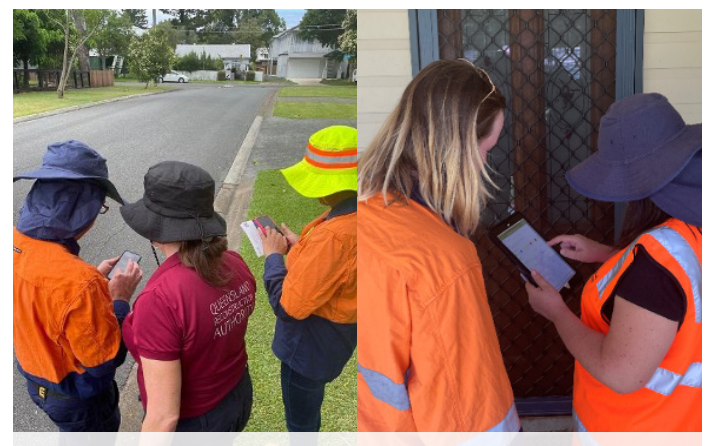
QRA staff undertaking the damage assessment operation 12 months following the South East Queensland flooding events in 2021-22

Over three weeks in February, QRA officers, supported by officers from NEMA, QFES, DRA and DCHDE, visited more than 3,600 homes, across 15 local government areas, that were affected in the 2022 South East Queensland flood to monitor recovery progress. The operation collected information on structural damage, insurance matters, and referred any urgent community recovery matters to DCHDE.