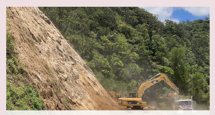
Mackay–Eungella Road – emergency works in progress (January 2023)