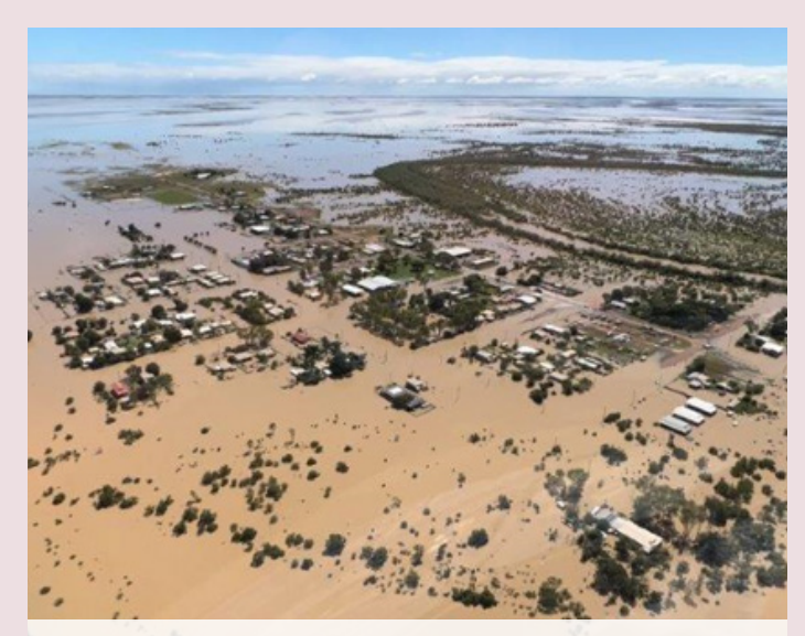
Aerial view of the Burketown Floods – 17 March 2023

The Queensland Government is committed to ensuring wherever and whenever disaster strikes, our communities receive the assistance they need to get back on their feet and look forward to a brighter tomorrow.