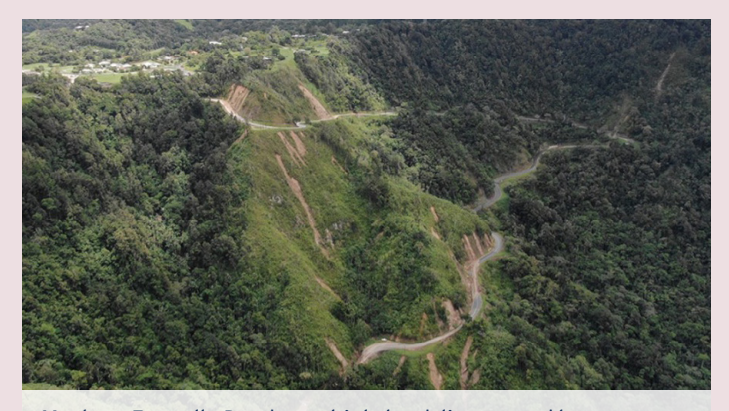
Mackay–Eungella Road – multiple landslips caused by Northern and Central Queensland Monsoon and Flooding event (January 2023)

Assistance will be provided through the jointly funded Commonwealth-State Disaster Recovery Funding Arrangements (DRFA).