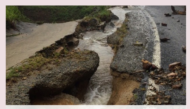
Mackay–Eungella Road – shoulder scour (January 2023)