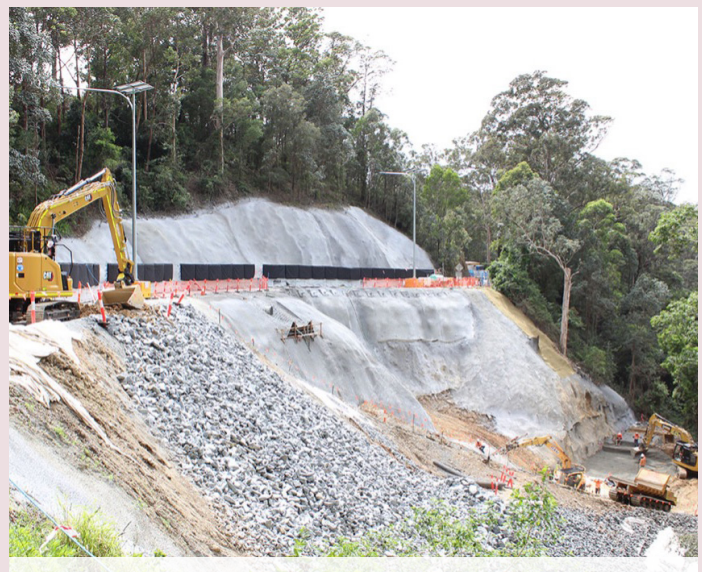
Beechmont Road – works in progress at major embankment failure site (February 2023)