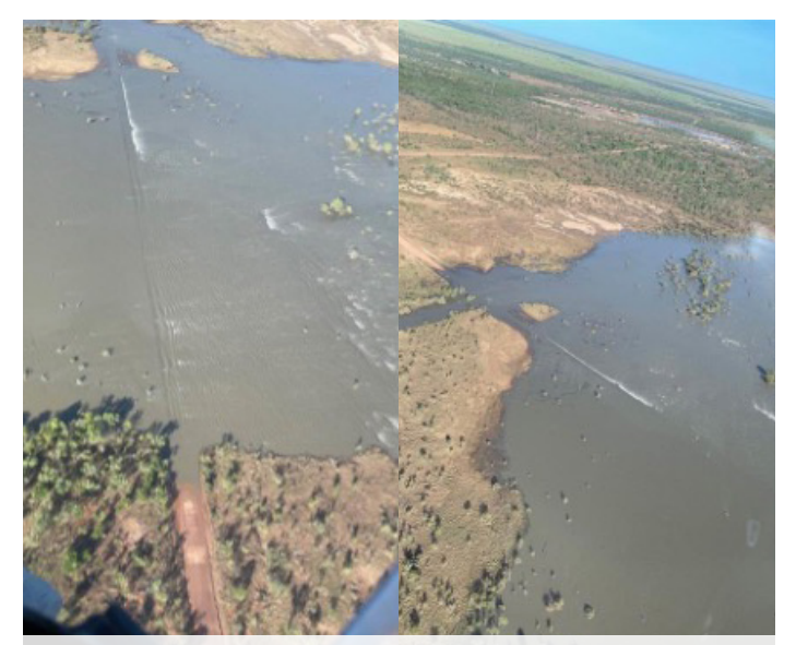
Aerial via of flood-impacted road access in Burke Shire Council

Remote primary producer properties have experienced long-term isolation (some since December 2022), meaning significant income loss as well as direct impacts from flooding such as significant stock losses, critical infrastructure, and fencing damage. A number of key roadhouses and accommodation providers on access roads to these council areas have also been directly impacted, and the lengthy repair timeframes and potential loss of trade will cause significant impacts.