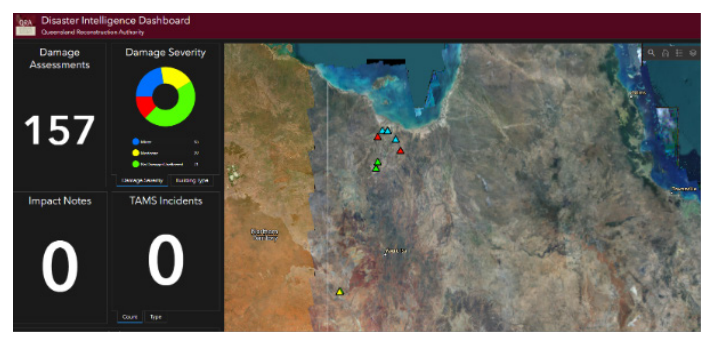
Damage assessment information from recent flooding in North West Queensland available internally to disaster management and recovery agencies via the QDMA 'Share' portal and QRA's Disaster Intelligence dashboard

Following the lowering of flood levels in the impacted areas of North West Queensland, QFES staff have been able to undertake initial or Rapid Damage Assessments of properties, homes, structures and community infrastructure in the most-impacted Local Government Areas. At the end of March, more than 150 damage assessments have been undertaken in Burke and Boulia Shire Council areas, providing critical and timely information of any impacted properties to assist response and recovery agencies with their activities.