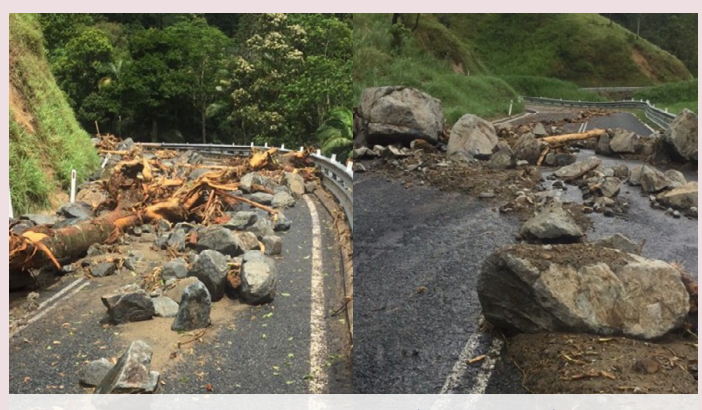
Mackay–Eungella Road – landslip site (January 2023)