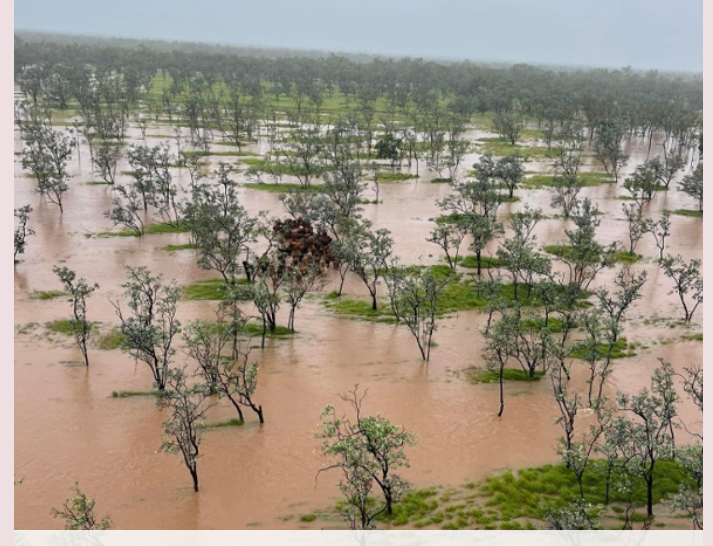
Stranded livestock – 17 March 2023