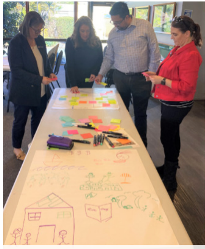
Inaugural National Indigenous Disaster Resilience Summit

QRA's Recovery team engaged with Local Governments, state and external recovery partners at the Queensland Fire and Emergency Services (QFES) Leadership in Disaster Masterclass sessions in Beenleigh, Brisbane and Toowoomba. The masterclass provided state and local recovery leaders with the skills to navigate challenging and complex natural disaster recovery conditions. Some themes from the discussions included the complexities of disaster situations, timeframes for recovery, the importance of self-care and ability to adapt when facilitating community led decision making (such as visual representation, shown in the photo below).