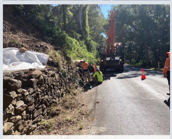
Tamborine Mountain Road – dry-stone wall works in progress