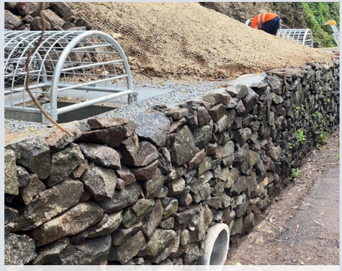
Tamborine Mountain Road – completed works (June 2023)