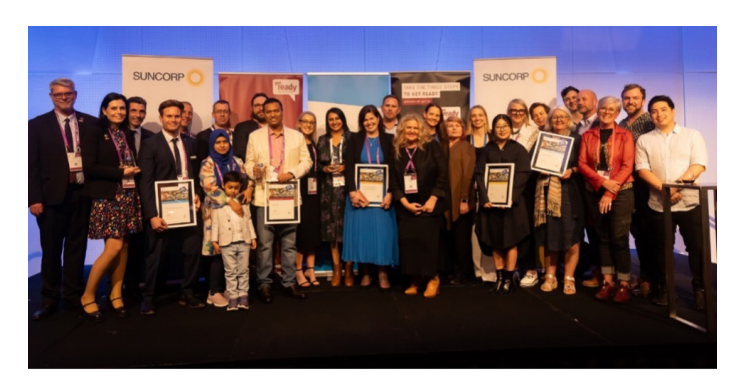
Some winners of the 2023 Queensland Resilient Australia Awards share the stage.

Winning projects will now progress as finalists for the National Resilient Australia Awards, which will be announced in late 2023.