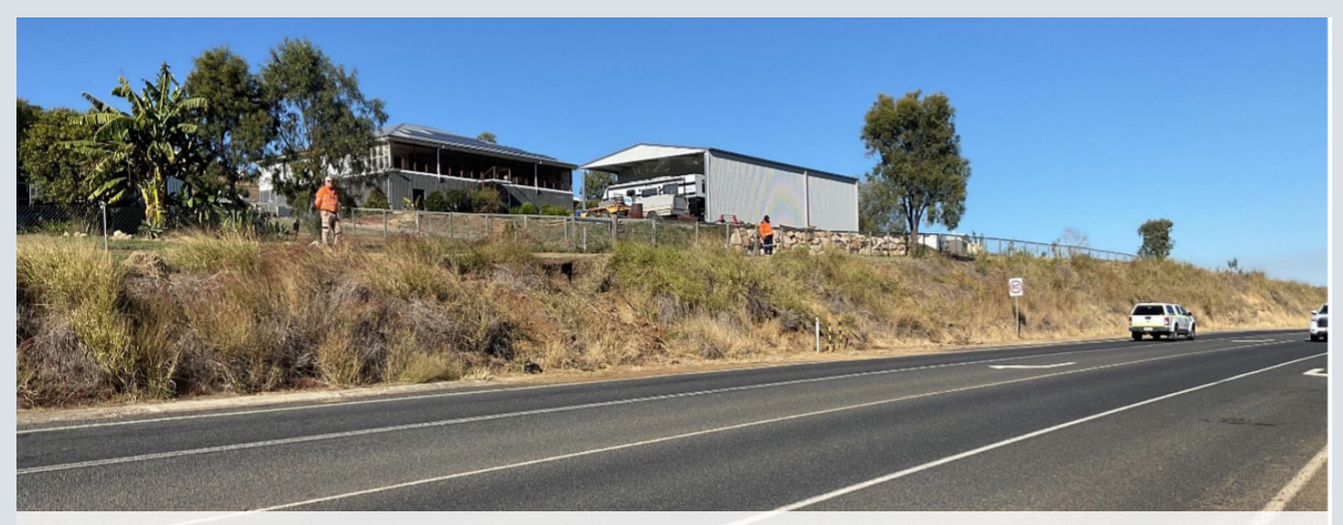
Tamborine Mountain Road – completed works (June 2023)

Assistance will be provided through the jointly funded Commonwealth-State Disaster Recovery Funding Arrangements (DRFA). The bund and part of the rockfill works were fully funded by the Queensland Government through the Queensland Transport and Roads Investment Program.