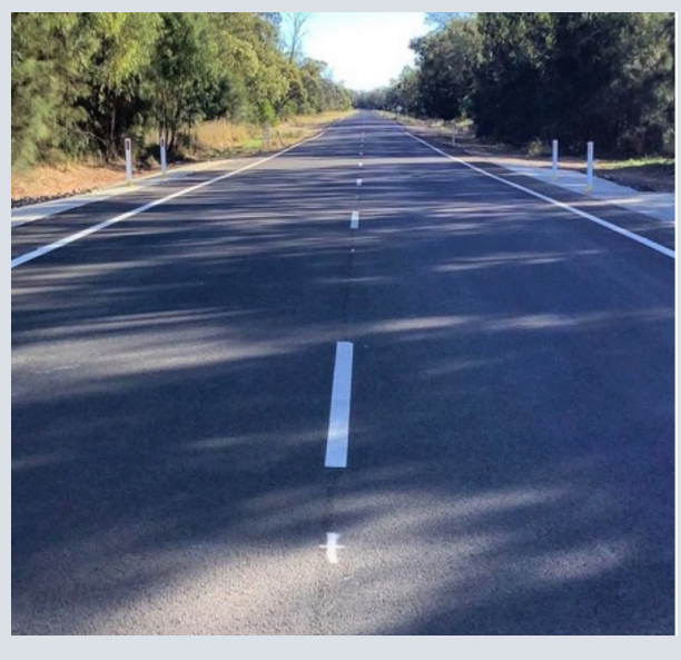
Betterment works complete on the Moonie Highway