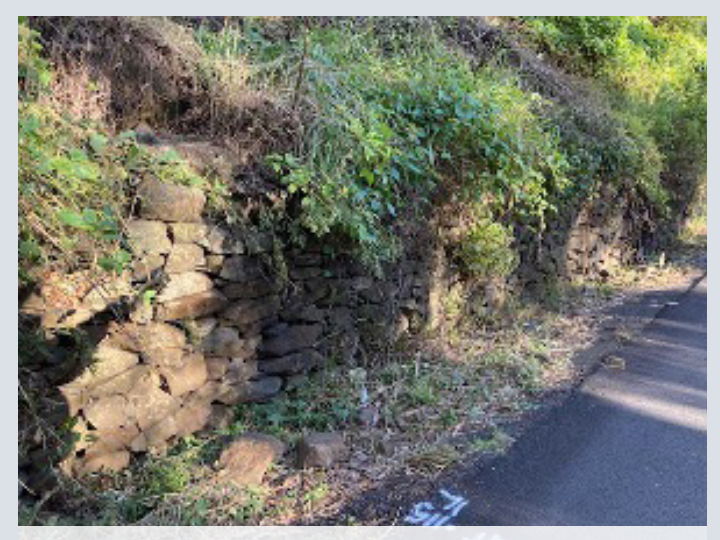
Tamborine Mountain Road – damaged dry-stone wall (March 2021)

Assistance will be provided through the jointly funded Commonwealth-State Disaster Recovery Funding Arrangements (DRFA).