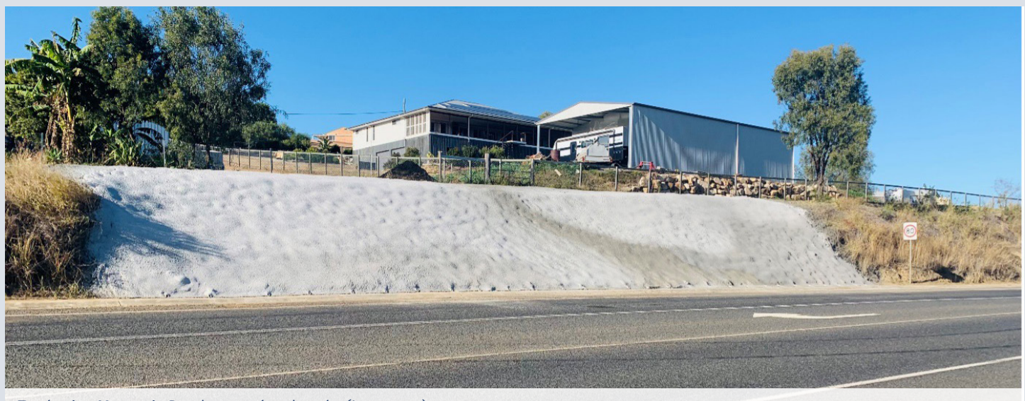
Tamborine Mountain Road – completed works (June 2023)